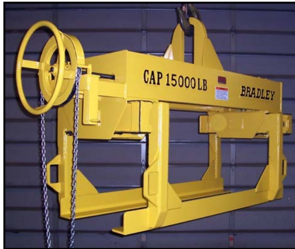
HAND OPERATED SHEET LIFTER