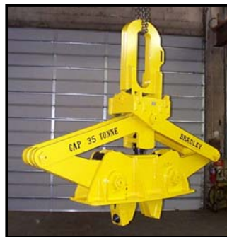
AUTOMATIC INTERNAL TONG