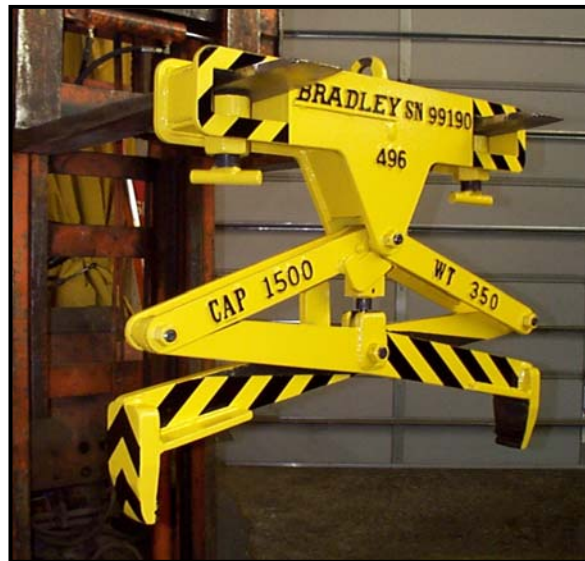
FORKLIFT MOUNTED AUTOMATIC GRAB