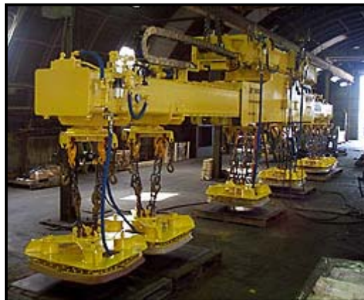
TELESCOPING VACUUM BEAM