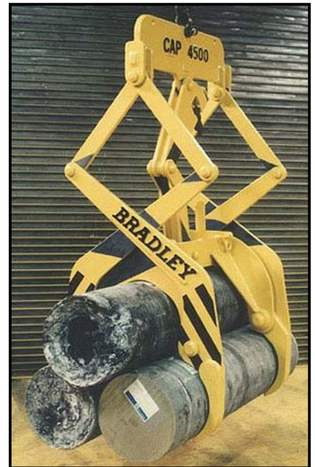
MULTIPLE BAR DIAMETER TONG