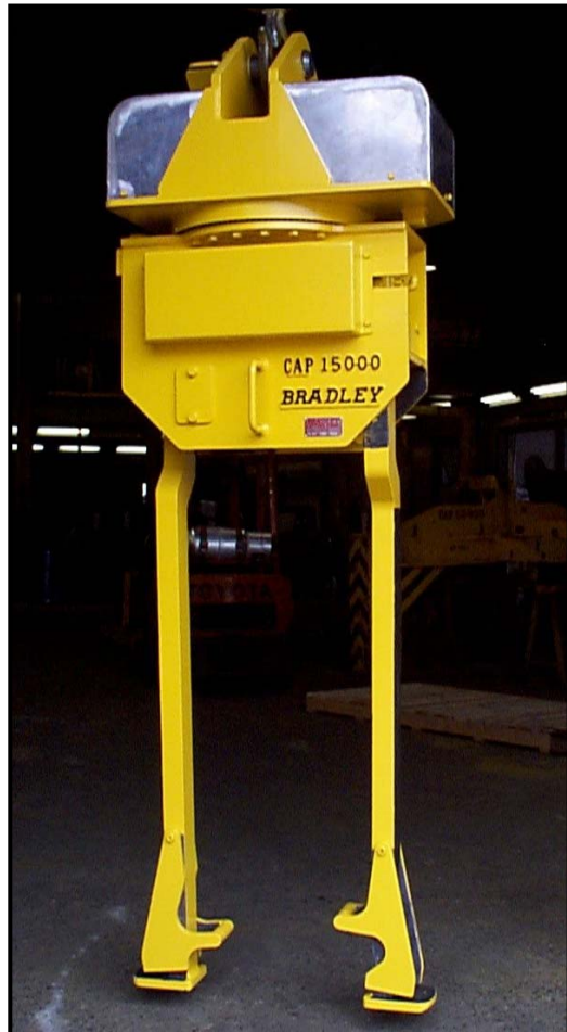
SLIT COIL STACK LIFTER WITH POWER ROTATE