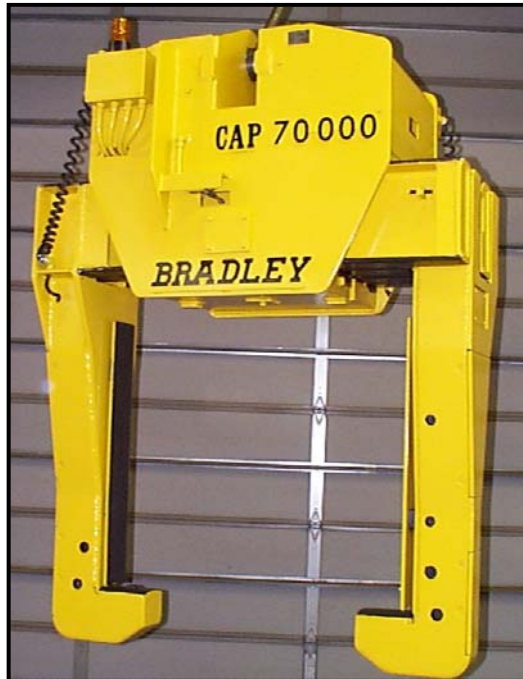
TELESCOPING COIL GRAB WITH LOW HEADROOM OPTION