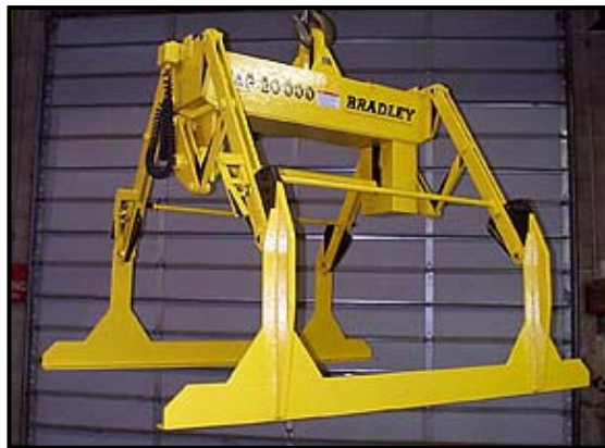
MOTOR DRIVEN SHEET LIFTER