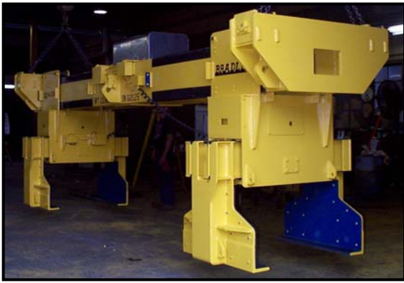
TELESCOPING PLATE STACK GRAB