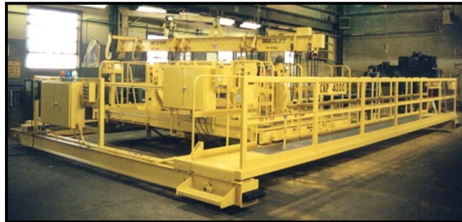
FLUE WALL CLEANER