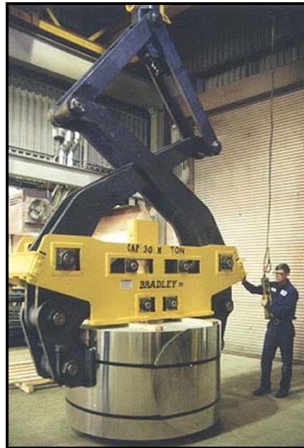
DOUBLE RIM COIL TONG FOR HIGH GRADE FINISHED COILS