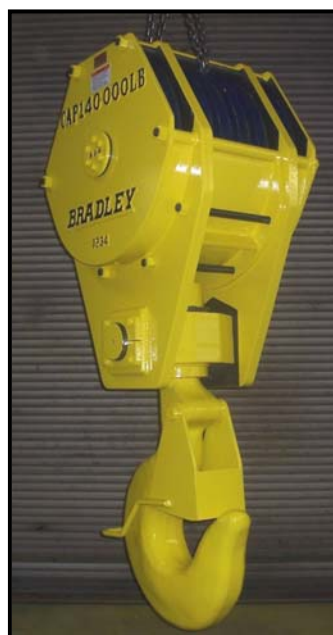
MILL DUTY BOTTOM BLOCK WITH HEAVY DUTY LATCH