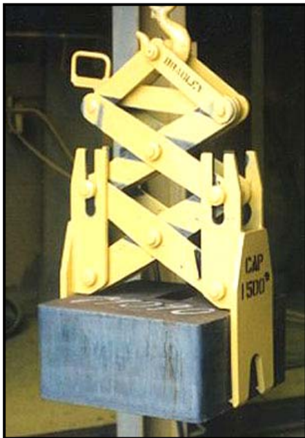
SEMI-AUTOMATIC BLOCK TONG FOR CONFINED SPACES