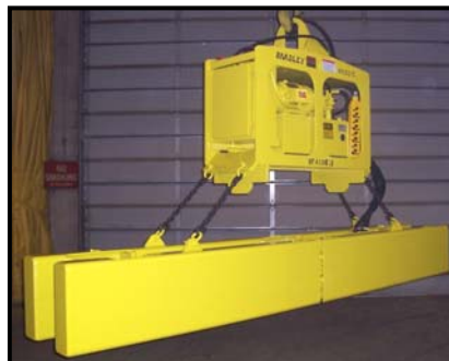
HYDRAULIC FLUE WALL STRAIGHTENER