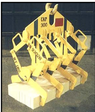
MULTIPLE BLOCK TONG