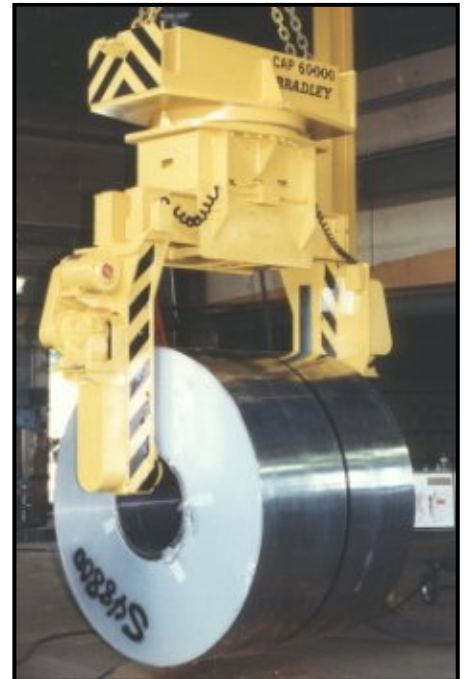
TELESCOPING COIL GRAB WITH POWER ROTATION AND COIL WIND / UNWIND