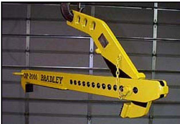
ADJUSTABLE BAR CLAMP