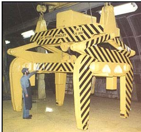
MOTORIZED MULTIPLE SLAB TONG