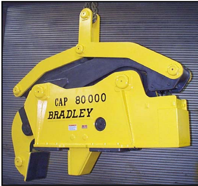
SINGLE RIM COIL TONG