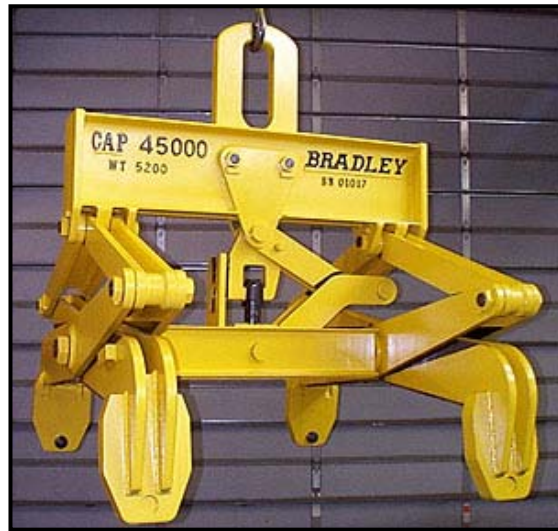
AUTOMATIC 4-POINT TONG