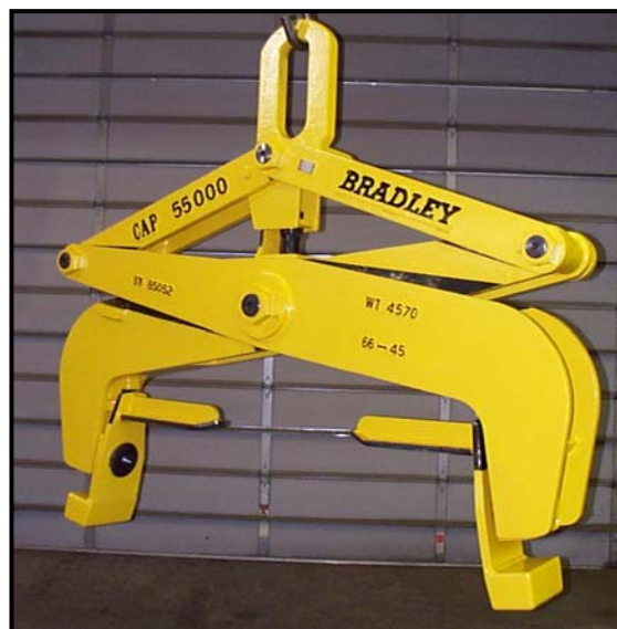
AUTOMATIC INGOT SWIVEL TONG FOR VERTICAL-TO-HORIZONTAL LOAD TURNING