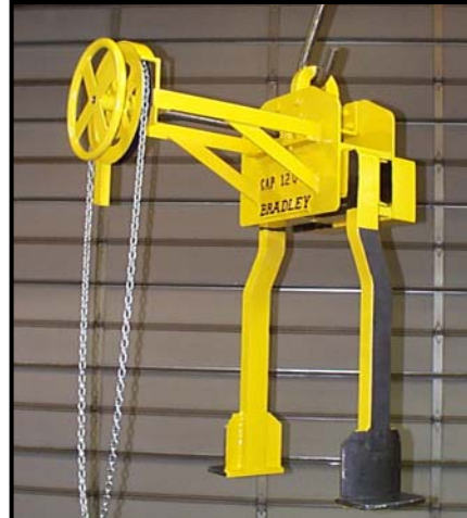
INSIDE DIAMETER LIFTER WITH HAND WHEEL