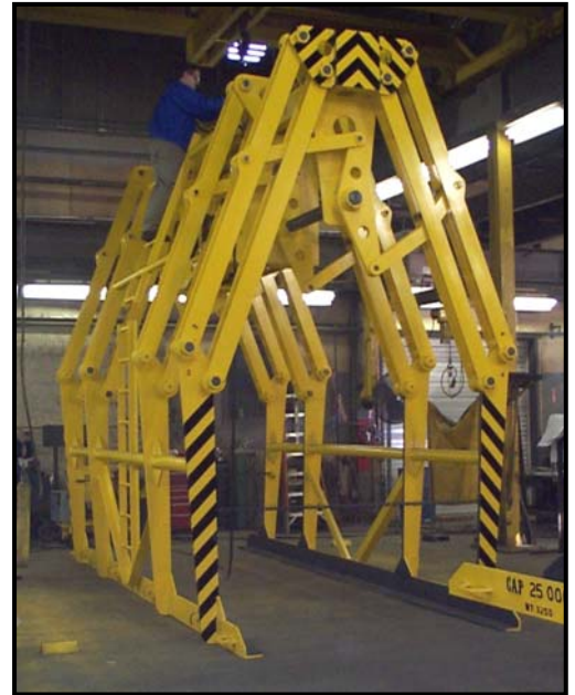
LARGE PARALLELOGRAM SHEET LIFTER