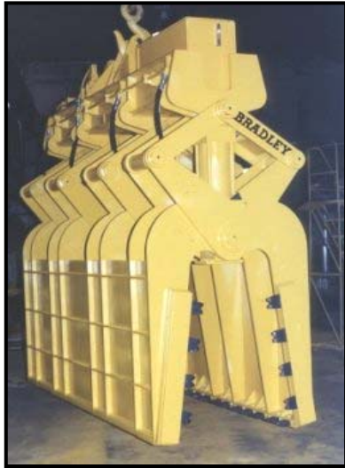
FLUE WALL DEMOLITION TONG