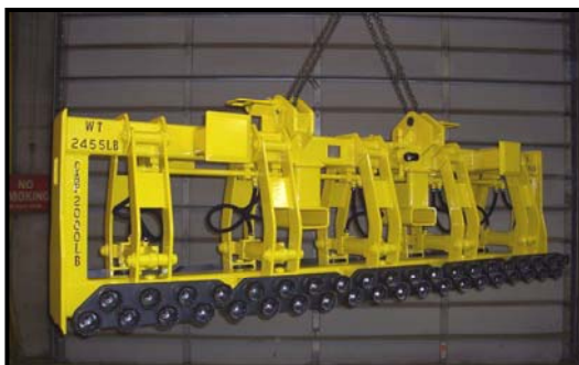
PIT MAINTENANCE PLATFORM