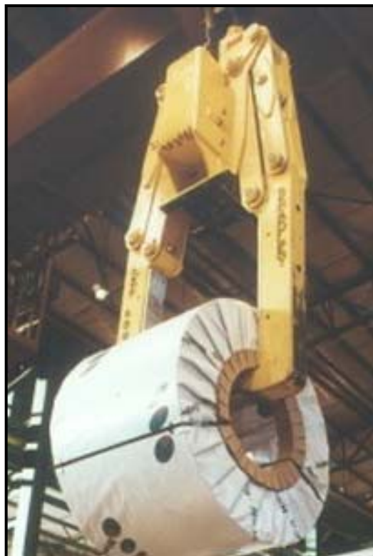
PARALLELOGRAM COIL GRAB AC OR DC MOTORS & POWER ROTATION OPTIONS AVAILABLE