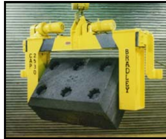
BLOCK ROLLOVER GRAB