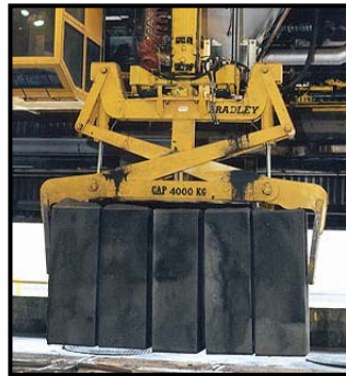
BOOK ENDING TONG