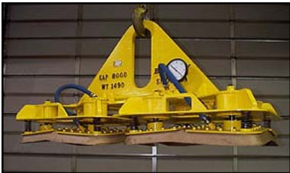
2 PAD (SEGMENTED) VACUUM LIFTER