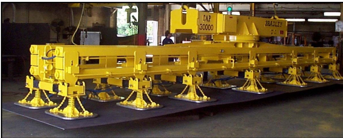
VACUUM LIFTING BEAM WITH ROTATE