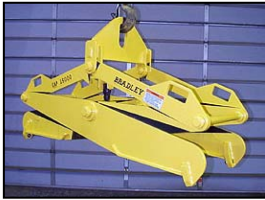
AUTOMATIC 4-LEG TONG FOR THIN PLATE