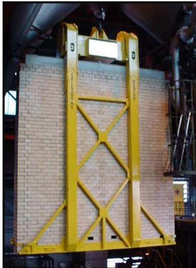
SIDE WALL LIFTER