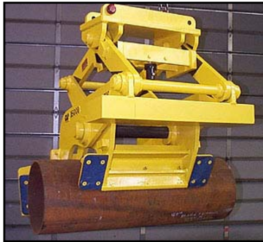
OFFSET DIAMETER TONG