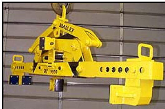
OUTSIDE DIAMETER TONG